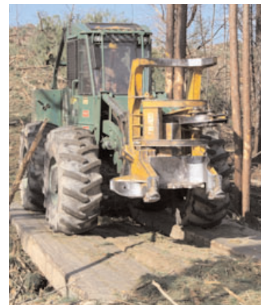
Portable bridge used to protect water quality.