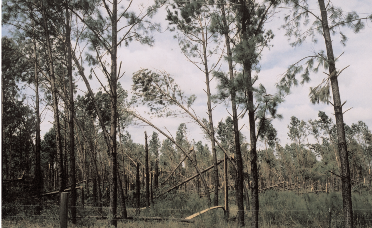
Forest damaged by hurricane.