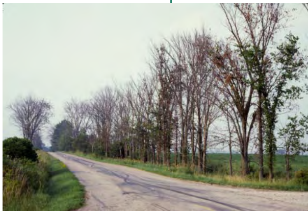
Dead and dying American elms along a country road in New England; decimated by Dutch Elm Disease, a complex involving a non-native (exotic) fungal pathogen and at least one exotic bark beetle.

The USDA Forest Service and others are now advocating and initiating efforts to collect seed of trees threatened by exotic insects and pathogens for re-establishment of the species after foreign invaders have killed off the current native populations and then died off themselves for lack of host material. The seriousness of the threats represented by invasive pest species resulted in a Presidential Order (#13112) in 1999, establishing a national Invasive Species Council and the development of a federal Invasive Species Plan. Effective measures, including public awareness and responsible action (particularly effective regulation of imported goods and associated packing materials) to prevent new introductions and minimize the impacts of exotics are essential.