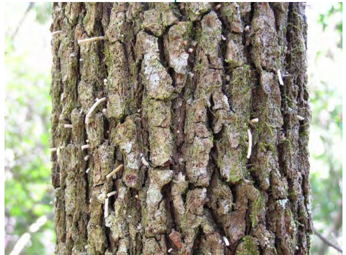
"Toothpicks" can be found on trees under attack.