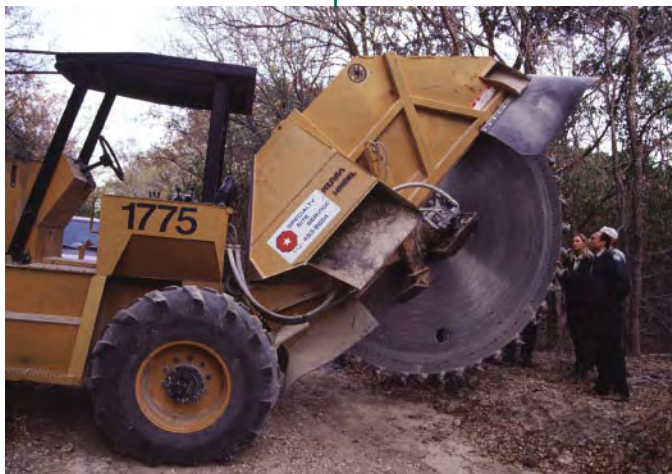
A rock saw capable of cutting a 60-inch trench through limestone is a common machine used for oak wilt trenching in Central Texas.

Oak wilt is caused by a native fungus, Ceratocystis fagacearum , a vascular pathogen that kills susceptible trees by blocking the water conducting system.