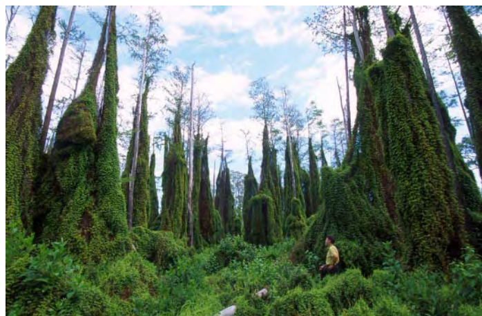
Old world climbing fern, a non-native (exotic) pest plant, growing on and among baldcypress in south Florida.

Interestingly, all of these diseases and insects have something in common. All are native (endemic to the southern U.S.)