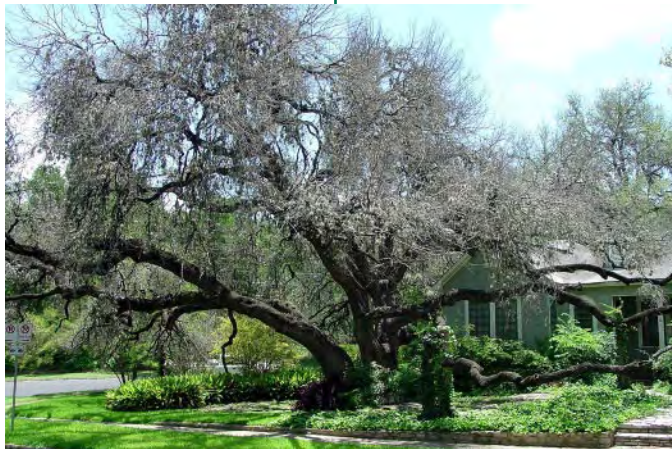
Oak wilt killed this valuable live oak in Austin, Tx.

To date, the suppression project has installed more than 3.36 million feet (637 miles) of trenches to control 2,400 oak wilt centers. This is equivalent to a single trench extending from Dallas to Birmingham, Ala. A Web page devoted to oak wilt management in Texas ( http://www.texasoakwilt.org ) offers additional information.