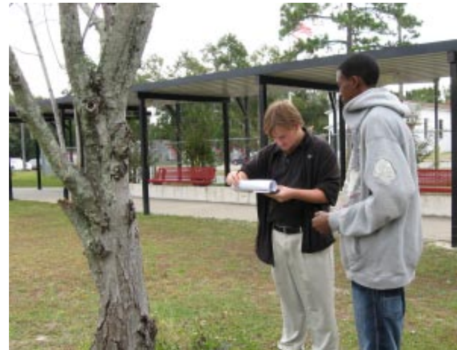
A student team working together to obtain tree data.

Urban Forests: A Supplement to Florida's Project Learning Tree: http://edis.ifas.ufl.edu/FR164